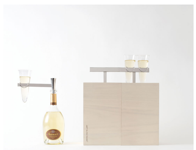
Kotoli for Ruinart picnic box 2011.05