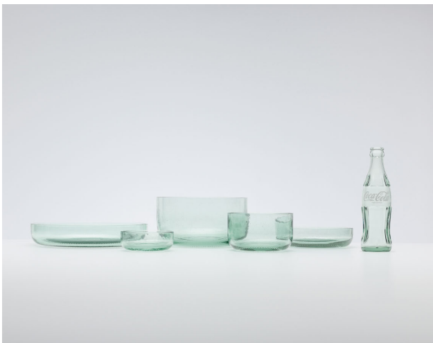
Bottleware for Coca-Cola dishware 2012.10