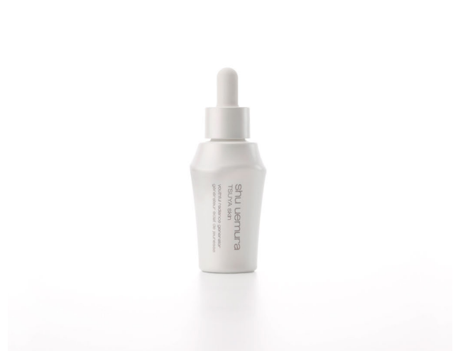
TSUYA-skin for Shu Uemura cosmetics 2012.08