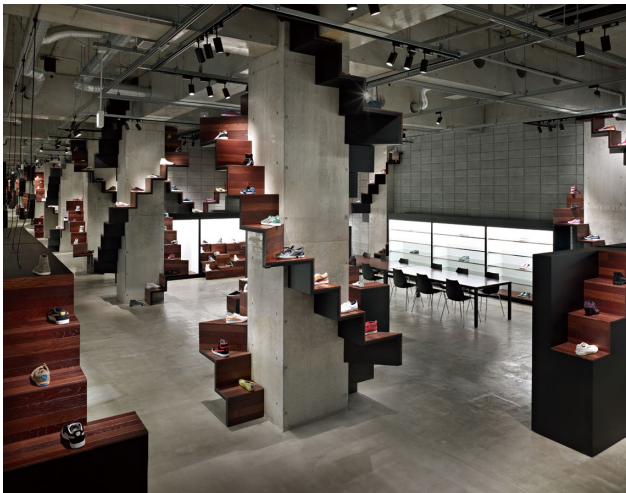
Puma House Tokyo event space for Puma 2011.04