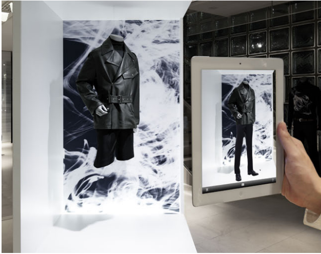
Hermès A man for all seasons installation for Hermès 2012.10