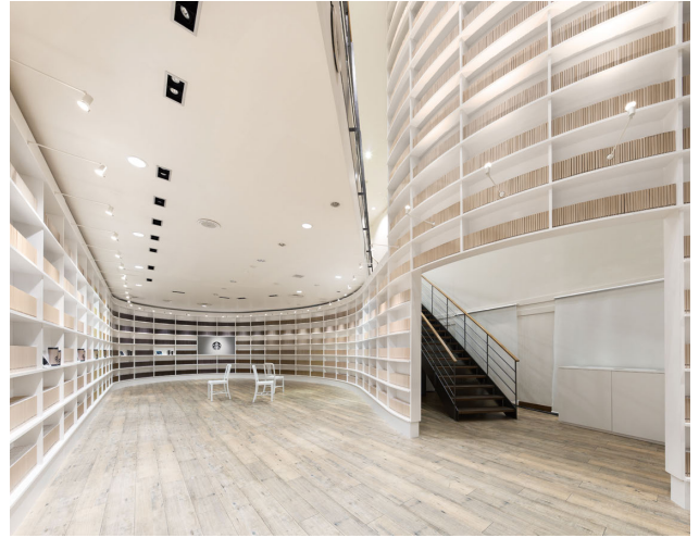
Starbucks Espresso Journey pop-up store for Starbucks 2012.09