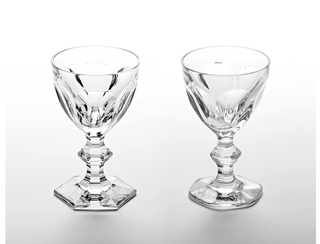
Harcourt ice for Baccarat glassware 2012.10