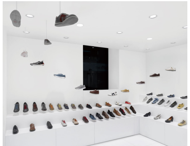
stores for Camper Paris/Istanbul/San Francisco/Osaka 2012.05