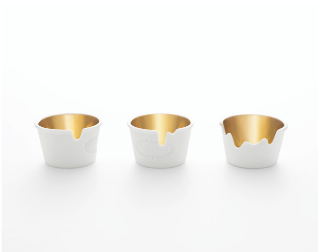
aroma cup for Häagen-Dazs candle holder 2012.05