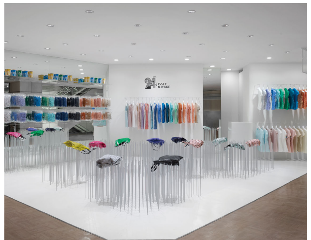
stores for 24 ISSEY MIYAKE Tokyo 2012.09